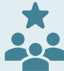
Longevity With Our Firm

Ultimately, it comes down to the bottom line: Consistent growth of revenue and assets under management.