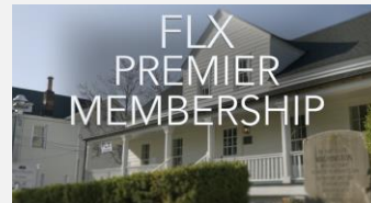
FLX Premier Membership