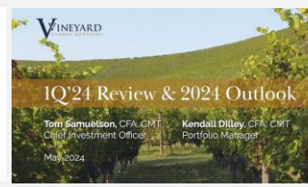
Vineyard Global Advisors 1Q'24 Review & Outlook