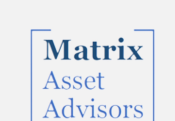
Matrix Asset Advisors