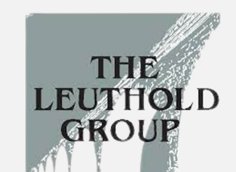
The Leuthold Group