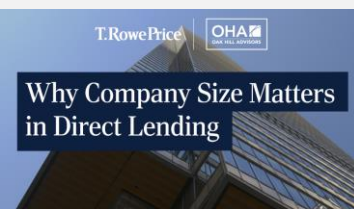
Oak Hill Advisors: Why Company Size Matters in Direct Lending