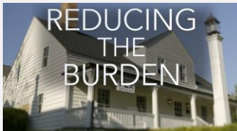
Reducing The Burden