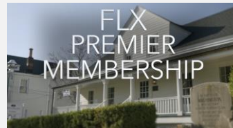
FLX Premier Membership