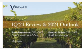
Vineyard Global Advisors 1Q'24 Review & Outlook