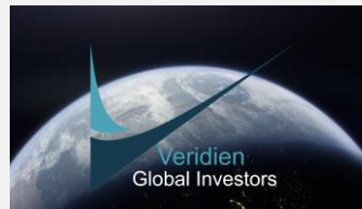
Veridien Global Investors