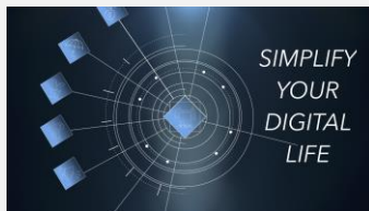
FLX Networks- Simplify Your Digital Life